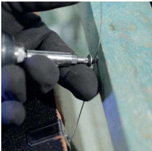
For cut roof tiles in the hip and valley.